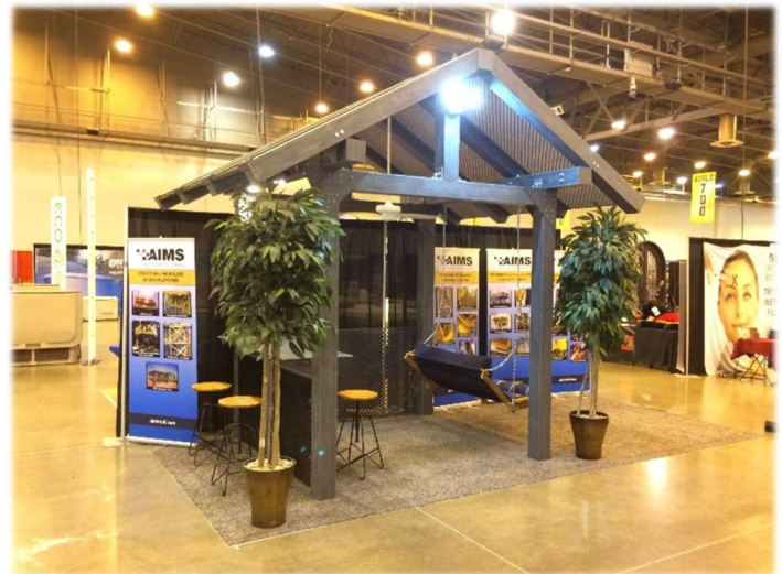
Fiberglass Pergola 6" x 6" structure used as electrical conduit for lights and