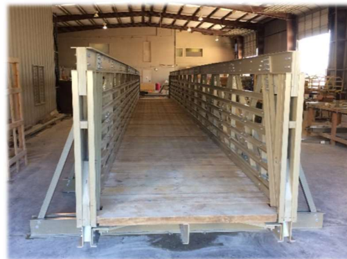
Delaware State Park: 60' fiberglass bridge