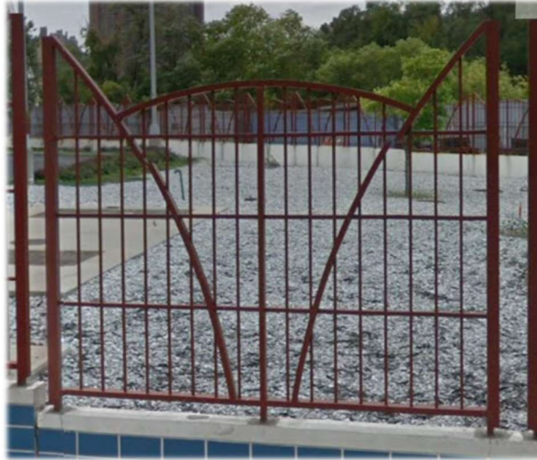
Decorative FRP Fence: New York substation

AIMS is a world leader in the fabrication and installation of fiberglass structural systems. As a turn-key fiberglass contractor, we design, fabricate and install fiberglass structural systems. The AIMS fabrication shop consists of 18,000 ft 2 of floor space with expansion capabilities to double in size to 36,000 ft 2 . Our experienced fabricators take engineered drawings and produce a fabricated product that is completely customized to meet the customer's requirements. As a full-service company, AIMS provides comprehensive field service, installation and repair.