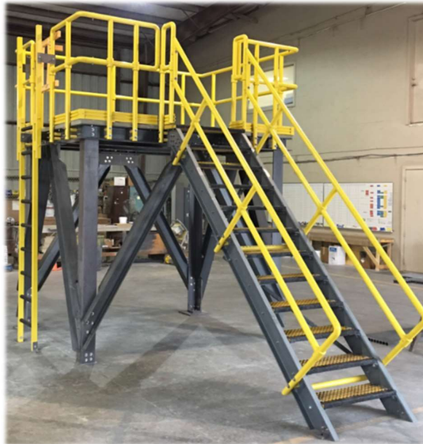
Fiberglass Access Platform