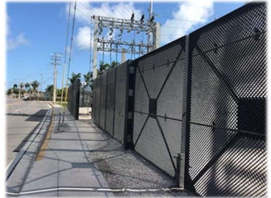
Key West, Florida: electrical substation security fence and gates